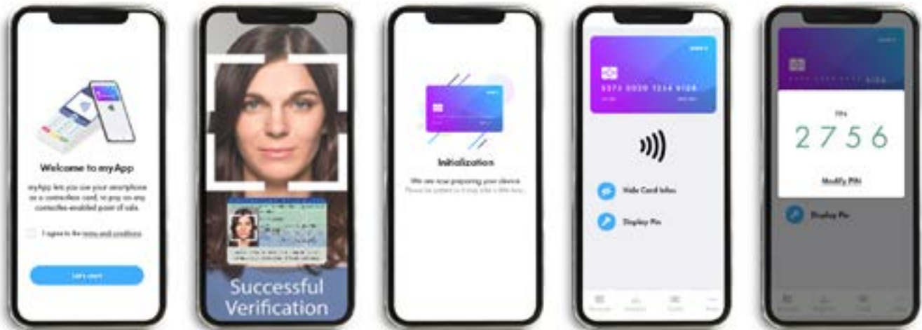
Welcome and Initialization